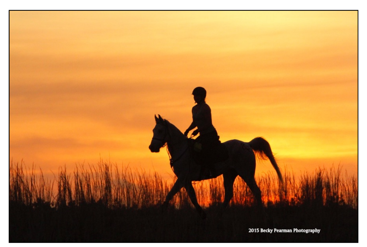
Unknown Rider at Dawn - Spring Fling at Sand Hills