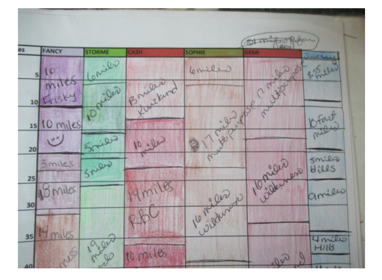
chart on December 1 of each year, and end it on the last day of the AERC ride season, the end of November.

So, with all this said, lets talk charts. Like I said before, I am using the graph paper notebook. It is a bit messy compared to the computer printouts. But only if you change horses before any miles are put on that individual. I only have one complete year in my graph notebook so far, and just started charting miles for 2017. I keep my miles on the AERC ride year, not the calendar year. So, I start my