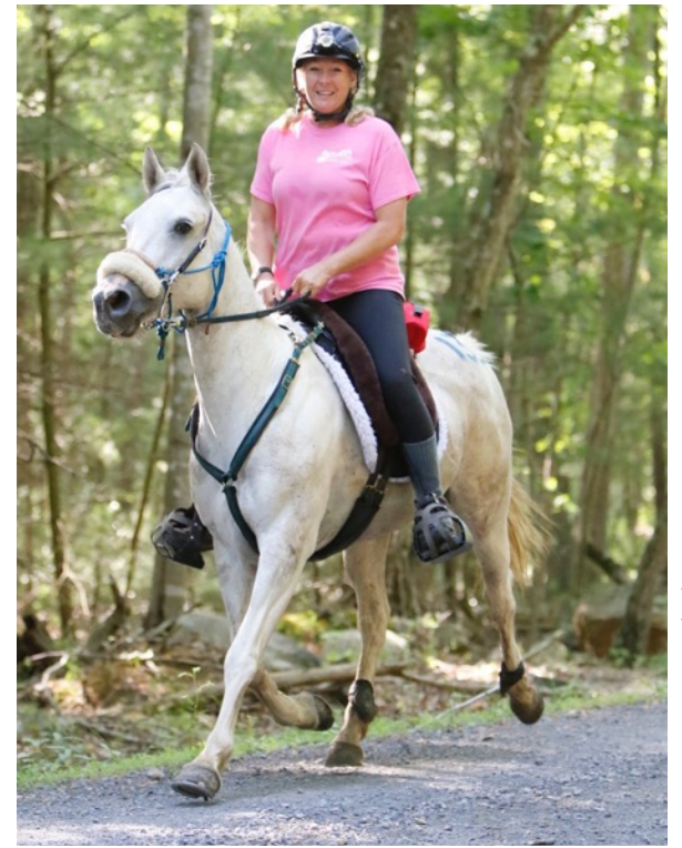
More photos from the Old Dominion