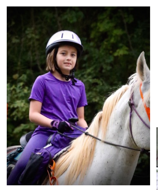
Scenes from the Iron Mountain Jubilee