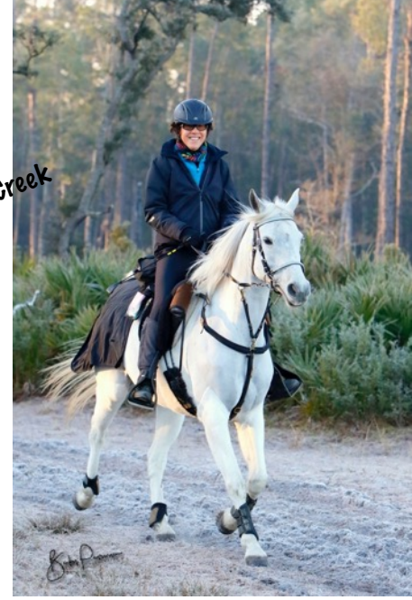
FITS FITS C 20,8